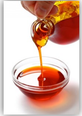
The pure CBD oil from our extractor is as thick as honey.